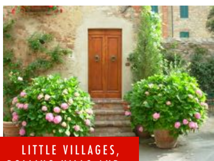
LITTLE VILLAGES, ROLLING HILLS AND GREAT FOOD AND WINE...